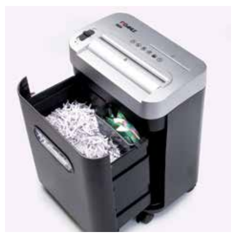
Separate, integrated waste box for sorting shredded paper and CDs, DVDs, cheque cards and credit cards for environmentally friendly recycling