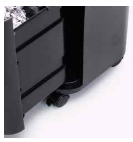
Practical swivel casters for flexible use