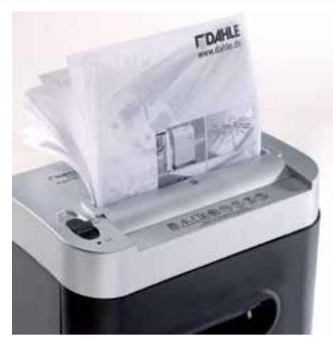
Paper easily feeds in sizes up to A5